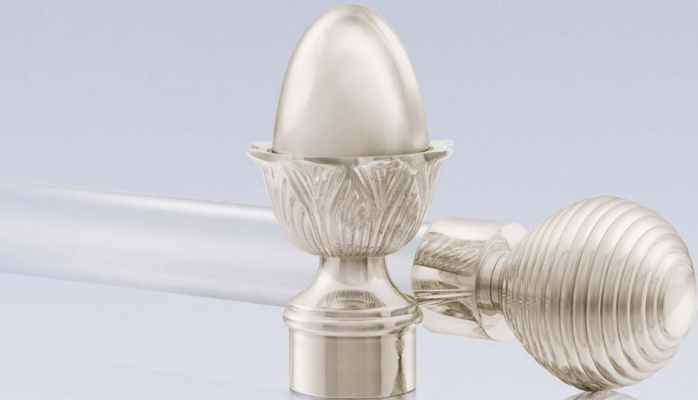
FNM9123 FINISH #92J5575PS FITS 1.375" ROD 1.375"

See page 10 for complete range of available accessories.