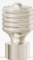
FNM9121 – 92J5575PS