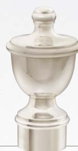
FNM9124 – 92J5575PS

FNA9128 FINISH #92J5575PS FITS 1.375" ROD