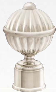
FNM9120 – 92J5575PS