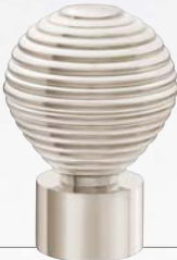
FNM9125 – 92J5575PS