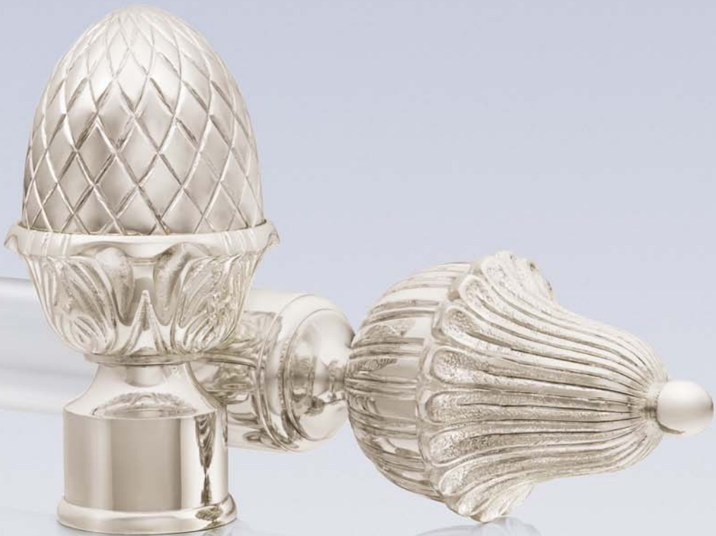
FNM9122 FINISH #92J5575PS FITS 1.375" ROD

See page 10 for specifications and available accessories.