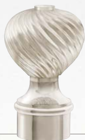
FNM9126 – 92J5575PS