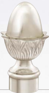
FNM9123 – 92J5575PS