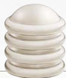
FNM9130 – 92J5575PS