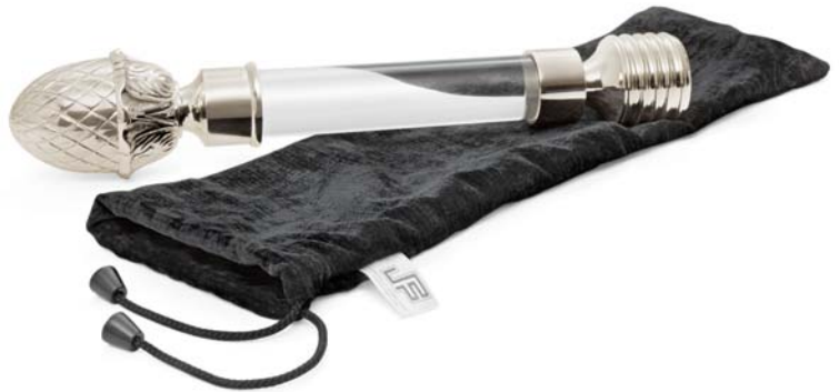
Sample wand: Reference #J5577 Purchase price: $70 each