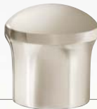
FNM9129 – 92J5575PS