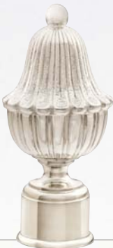
FNM9127 – 92J5575PS