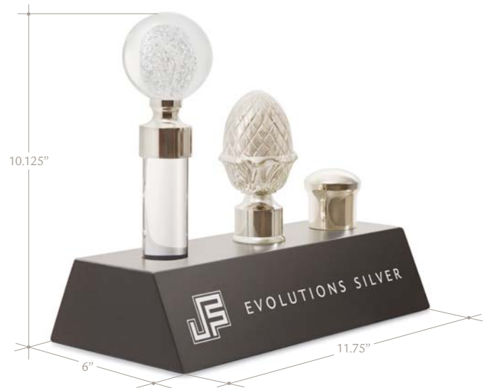
Countertop display: Reference #J5576 Purchase price: $125 each

Complement your drapery hardware catalogue with our countertop display and sample wand. Sold separately.