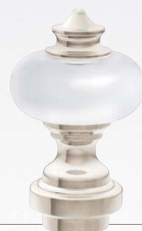
FNA9128 – 92J5575PS