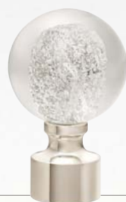
FNG9131 – 92J5575PS