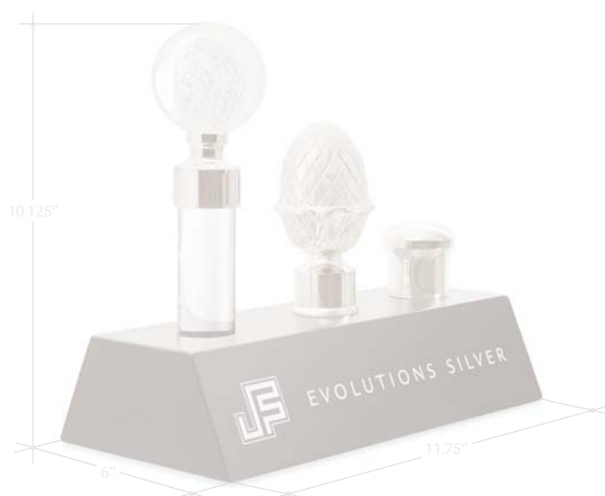
Countertop display: Reference #J5576 Purchase price: $125 each

Complement your drapery hardware catalogue with our countertop display and sample wand. Sold separately.