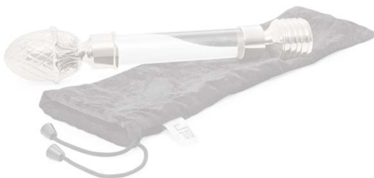
Sample wand: Reference #J5577 Purchase price: $70 each