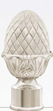
FNM9122 – 92J5575PS