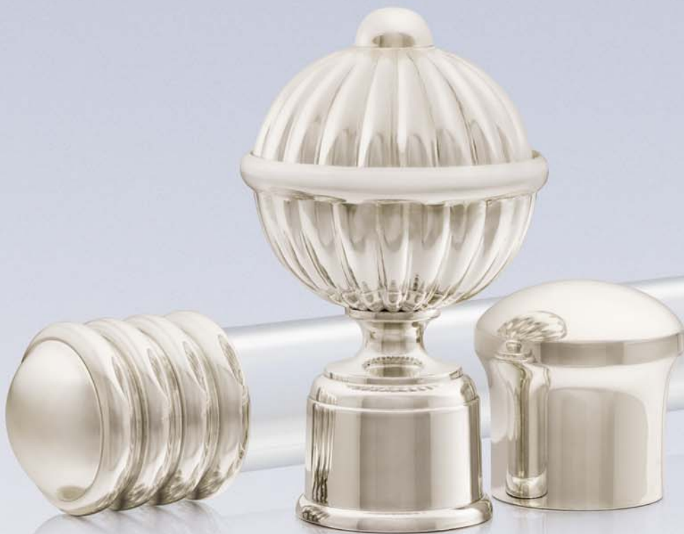
1.375" FNM9130 FINISH #92J5575PS FITS 1.375" ROD