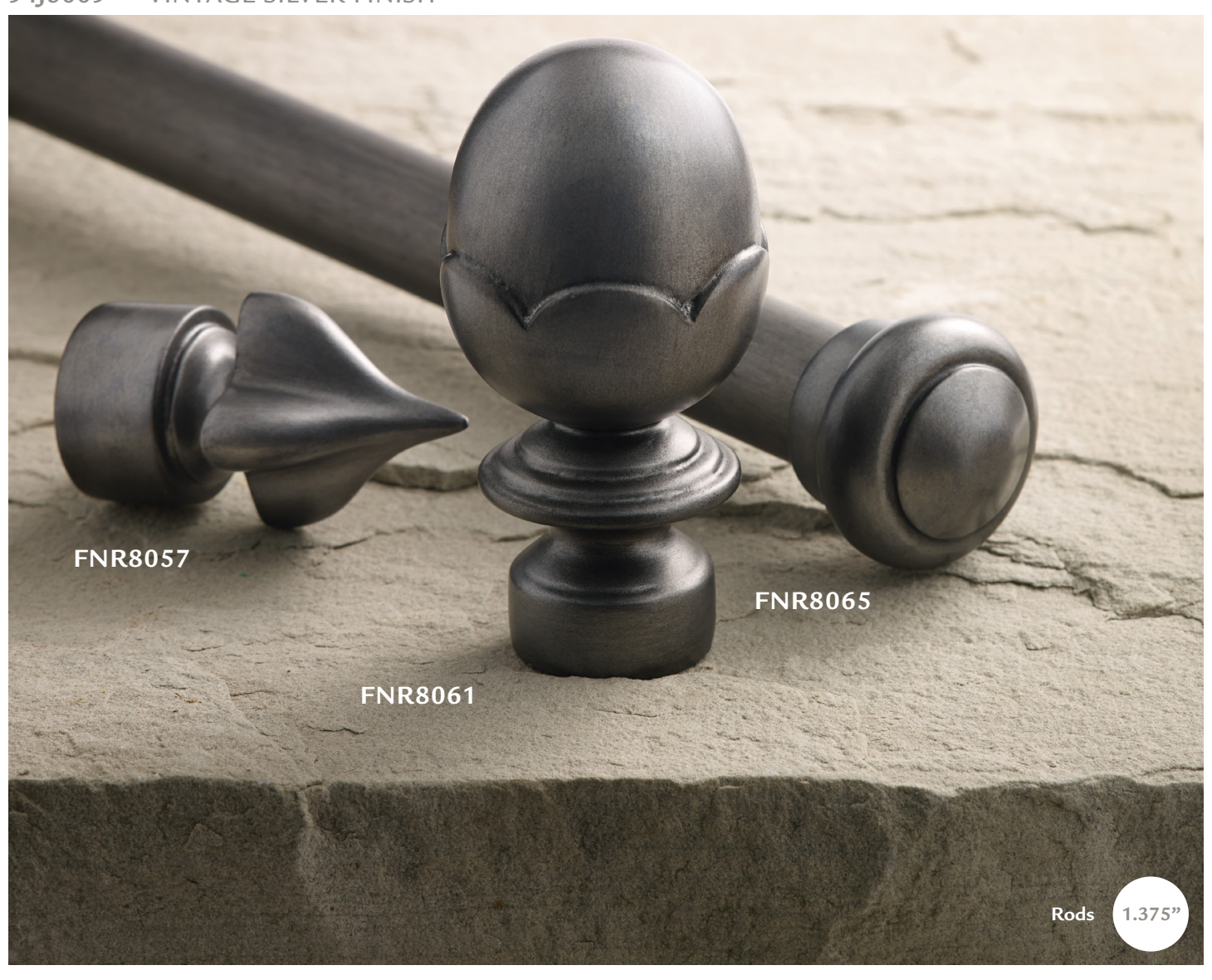
94J5009 - VINTAGE SILVER FINISH