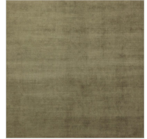
POSH 72J5831 FABRIC