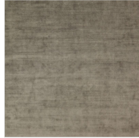
POSH 95J5831 FABRIC