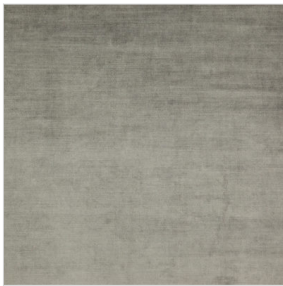
POSH 97J5831 FABRIC