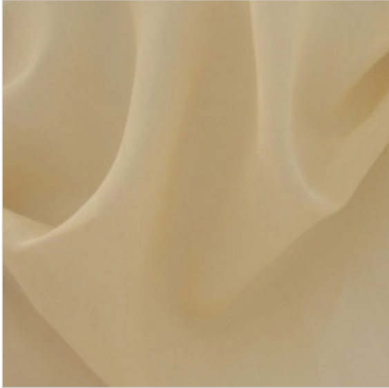
BUFFY 23J5921 FABRIC